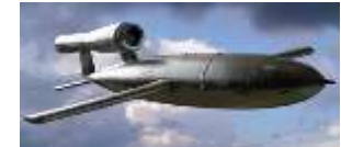
Doodlebug German bomb with wings.