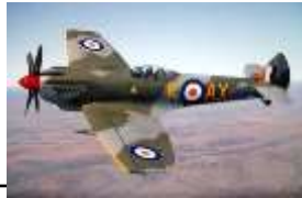
Spitfire A British WW2 fighter plane.