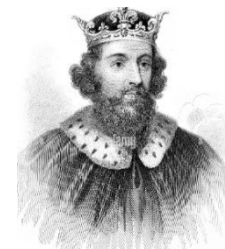
King Alfred the Great