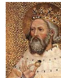
Edward the Confessor